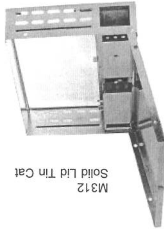
M312 Solid Lid Tin Cat